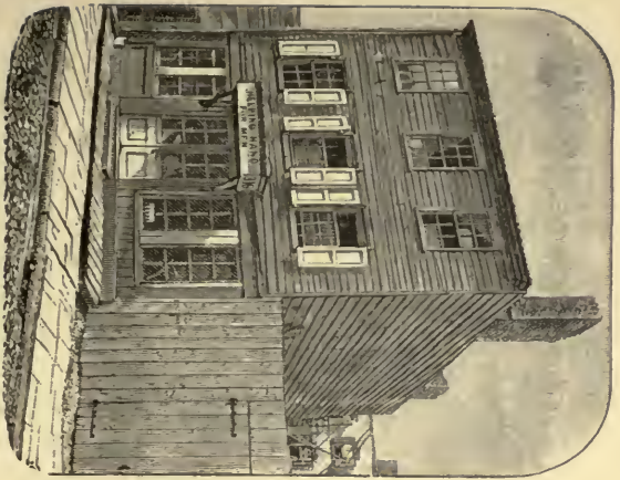
THE HELPING HAND. The Old Building, 316 Water Street.